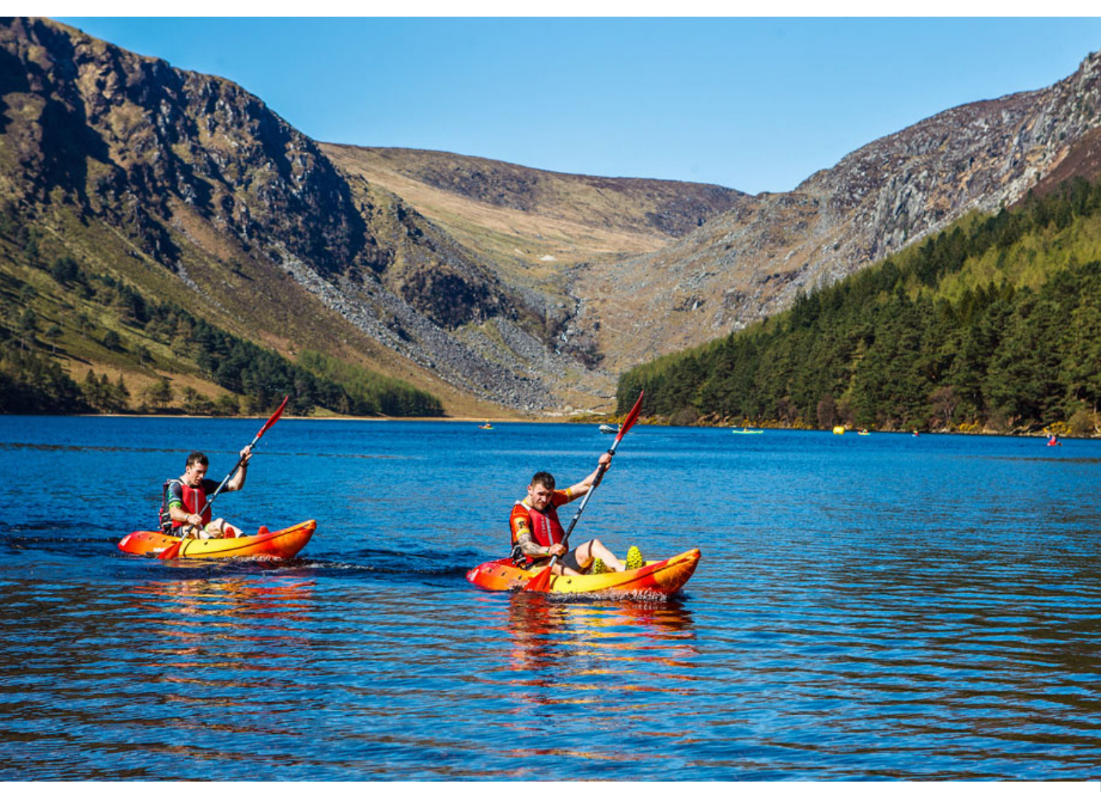
\ \ \, \mathbb{C} clearskiesahead