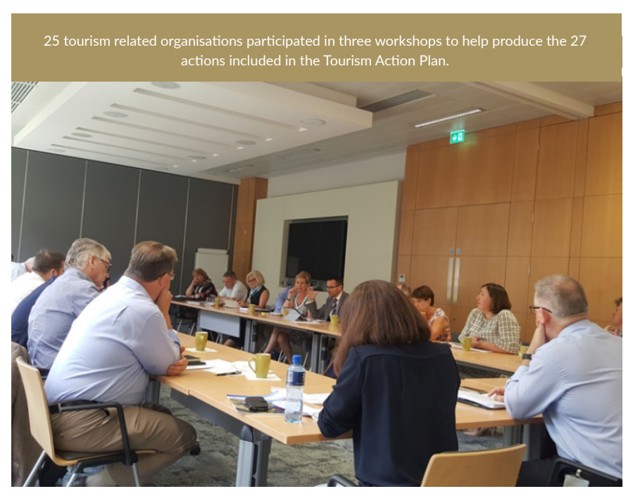
Picture from the second Tourism Action Plan workshop held in June 2018.

In order to sustain the recent success in tourism, a Tourism Action Plan for the three year period 2019-2021 has been developed. Over the summer and early autumn of 2018, three workshops were held to consult with Tourism Leadership Group members, the tourism agencies and other key tourism stakeholders.