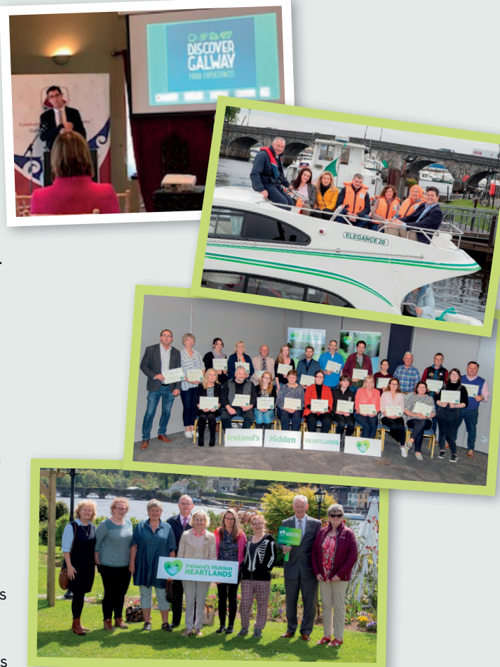
Accredited Service Excellence Workshop (green frames): (top) Carrick on Shannon, (above middle) Athlone and (above) Killaloe

Another key milestone was the launch of Fáilte Ireland's new Website Improvement Programme in June which aims to improve the shop window for visitors researching a visit to Ireland's Hidden Heartlands online. The 44 participating tourism businesses (all either visitor attractions or activity providers) will develop a Website Improvement Plan which will identify the changes and improvements they each need to make to their websites to help their businesses grow. The programme will help these businesses improve website content and the user experience, ensure websites are fully responsive, improve conversion rates and that they are optimised for SEO. Fáilte Ireland has invested €1 million into the programme which will pay for the necessary website improvements to be made before the start of the 2020 tourist season.