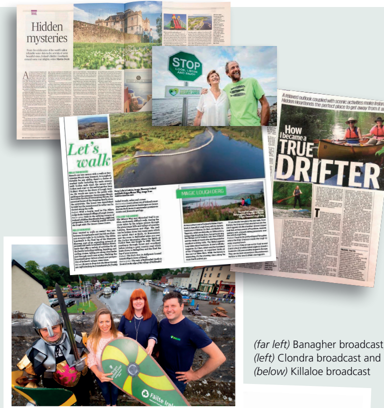
(far left) Banagher broadcast, (left) Clondra broadcast and (below) Killaloe broadcast

One of the key activations was the Ray D'Arcy Show, which was broadcast live on RTÉ Radio from 8th - 12th July in five locations across Ireland's Hidden Heartlands. Live broadcasts took place in Killaloe / Ballina in Clare & Tipperary, Cloondara in Longford, Acres Lake in Leitrim, Banagher in Offaly and in Cavan Town. This show has a Daily listenership of 230k. Ray also talked about his many experiences on air after visiting attractions and taking part in activities on land and water throughout the week. This also included a written feature on the RTÉ website.