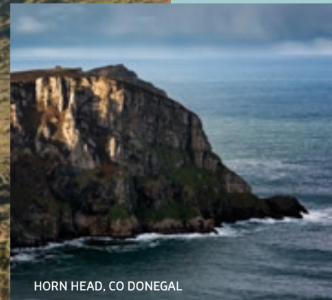
HORN HEAD, CO DONEGAL