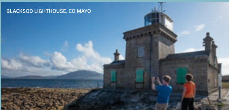
BLACKSOD LIGHTHOUSE, CO MAYO