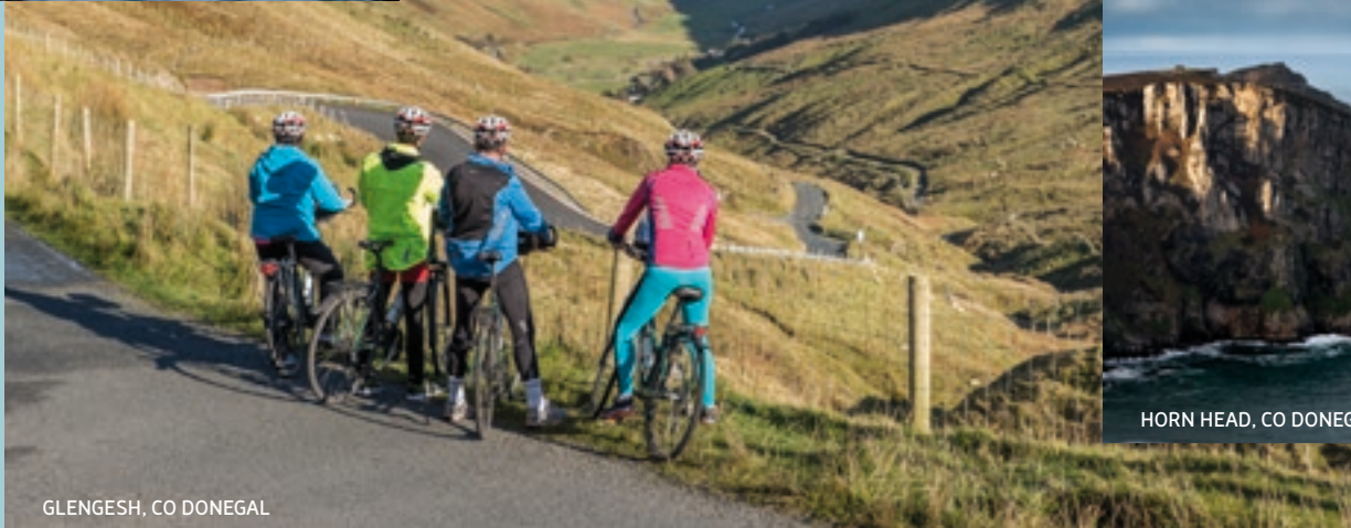
GLENGESH, CO DONEGAL