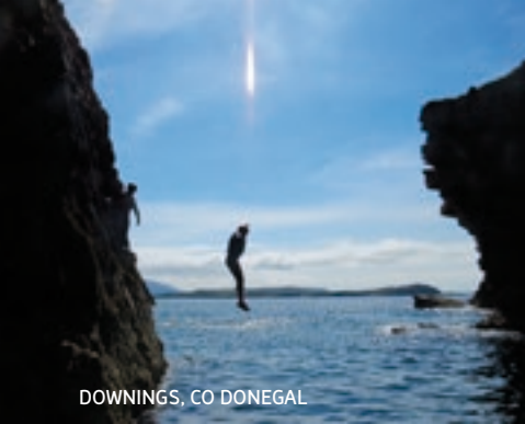
DOWNINGS, CO DONEGAL