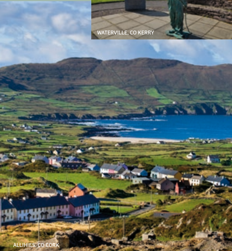
ALLIHIES, CO CORK