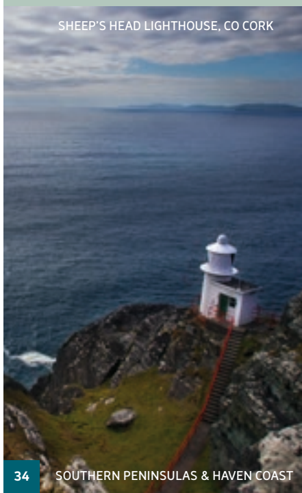
SHEEP'S HEAD LIGHTHOUSE, CO CORK

Baltimore Beacon is a "must see". This large, white-painted stone beacon at the entrance to the harbour was built at the order of the British government following the 1798 Rebellion. With spectacular views of the surrounding islands - Cape Clear, Sherkin and Fastnet - dusk brings an awesome display of colour as the sun sets over the Atlantic. Overnight in one of Baltimore's many accommodation options.