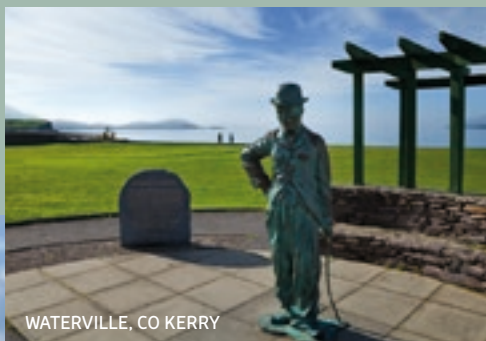
WATERVILLE, CO KERRY

On arrival in Kenmare, stretch the legs by embarking on the Kenmare Heritage Trail. From Kenmare head west towards Sneem. Sneem Sculpture Park makes for an interesting pit-stop; a treasure trove of international sculptures including a carving donated by the People's Republic of China. In pretty Waterville, teeming with culture, visit Sea Synergy Centre, Skellig Gift Store and outdoor exhibition, Tech Amergin Community Arts and Exhibition Centre and two wonderful links golf courses. The town also boasts a statue of Hollywood icon Charlie Chaplin, who loved this tranquil part of the world, and a statue of local GAA Legend Mick O'Dwyer. Relax over dinner and drinks, and be sure to seek out a traditional music session.