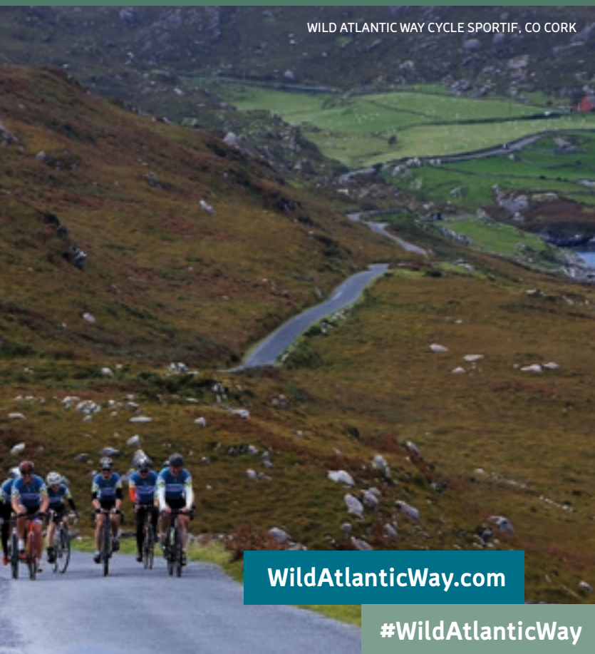
WILD ATLANTIC WAY CYCLE SPORTIF, CO CORK

Our coastline is precious and home to a vast array of habitats and wildlife. These fragile organisms survive in harsh environments and are vulnerable to visitor impacts. Visitors to the Wild Atlantic Way have a responsibility to minimise their impact on the environment. Leave No Trace Ireland is helping to create an ethic of understanding, responsibility and care for Ireland's Wild Atlantic Way. To learn more about how you can Leave No Trace, visit www.leavenotraceireland.org .