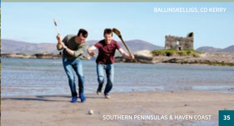
BALLINSKELLIGS, CO KERRY

That's just one of our many Wild Atlantic Way itineraries; you'll find more covering all six zones with lots of diverse activities and interests at www.wildatlanticway.com