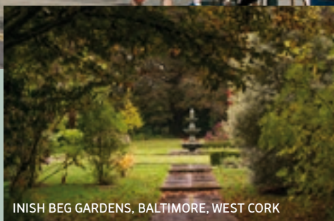
INISH BEG GARDENS, BALTIMORE, WEST CORK