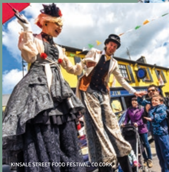
KINSALE STREET FOOD FESTIVAL, CO CORK

BALTIMORE DEEP SEA ANGLING FESTIVAL Baltimore, Co Cork www.baltimore.ie