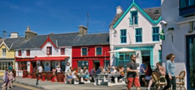
SKIBBEREEN, CO CORK