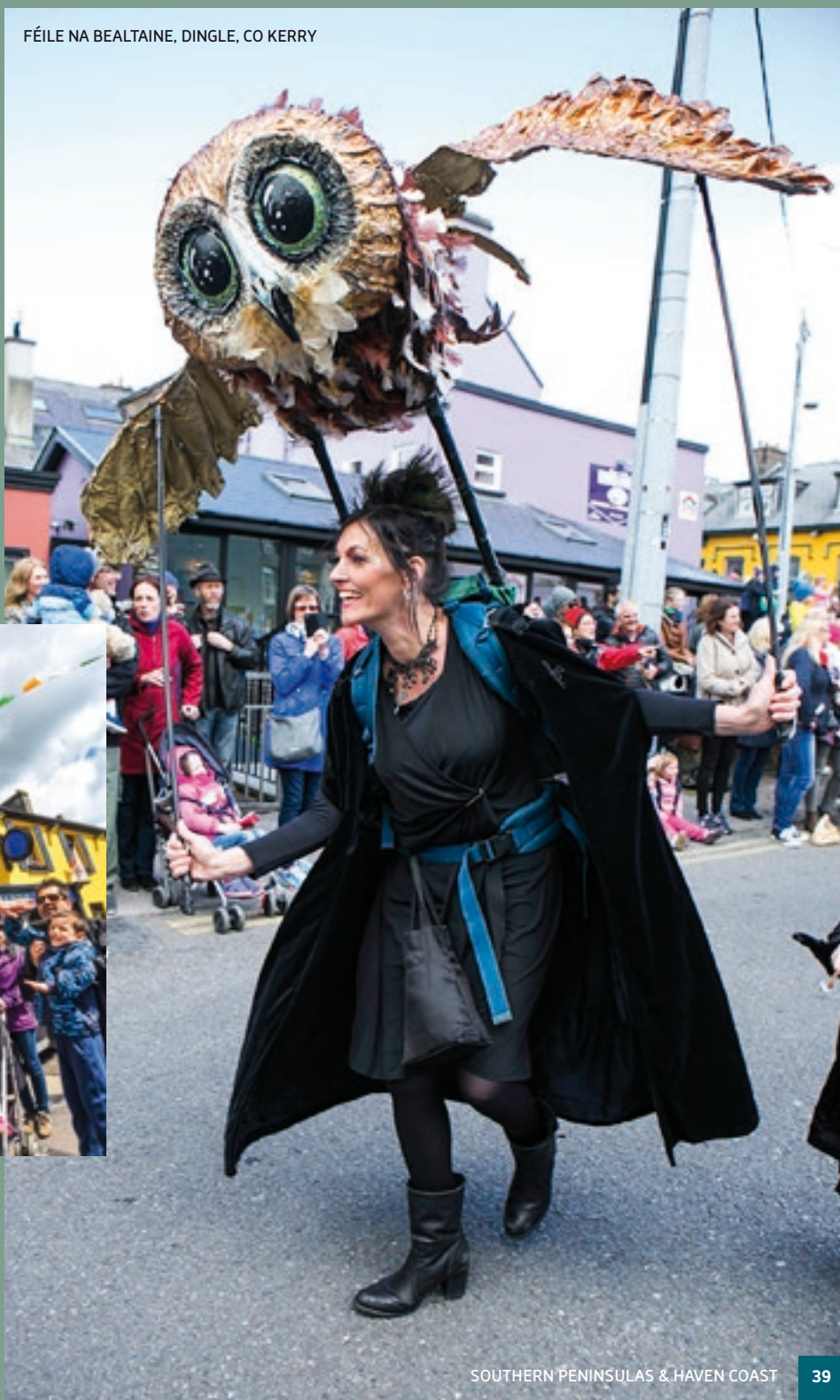
FÉILE NA BEALTAINE, DINGLE, CO KERRY

KINSALE LIONS ANNUAL WALKING FESTIVAL Kinsale, Co Cork www.kinsalewalkingfestival.com