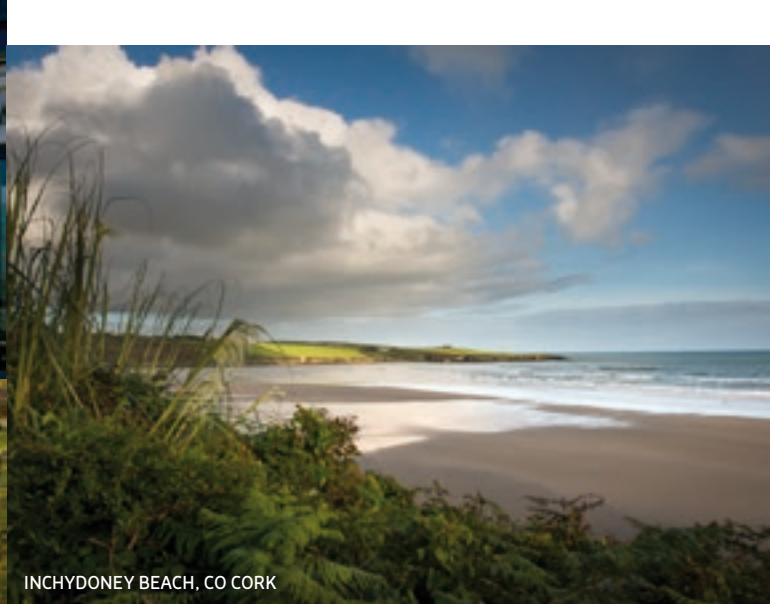
INCHYDONEY BEACH, CO CORK