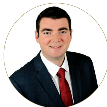
Shane Ross T.D. Minister for Transport, Tourism and Sport

A handwritten signature in black ink, reading 'Brendan Griffin T.D.' in a cursive style.