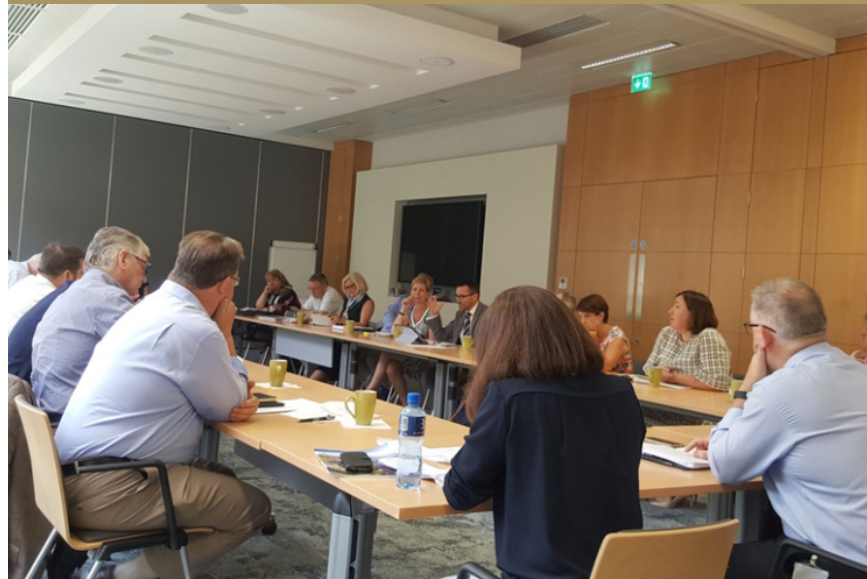
Picture from the second Tourism Action Plan workshop held in June 2018.

25 tourism related organisations participated in three workshops to help produce the 27 actions included in the Tourism Action Plan.