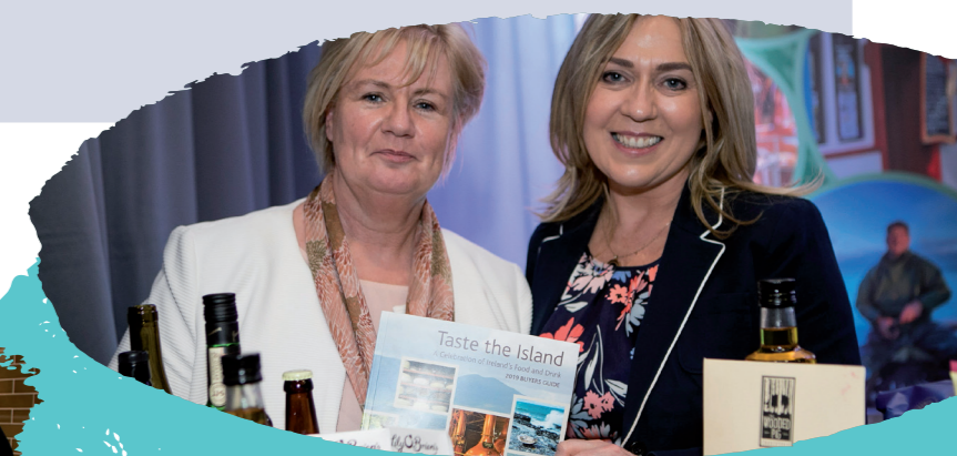
The hugely popular Taste the Island buyers guide for Meitheal 2019 has a total of 185 Experiences as well as the suggested itineraries and the 24 hour City Immersions. The food bible proved to be a major talking point at Meitheal and an extremely popular guide for all who attended – we can safely say nobody left without it!