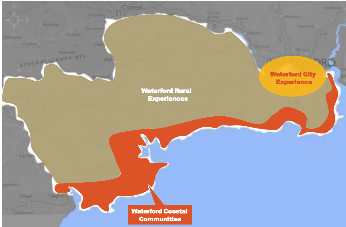
Figure 2-1 Visitor destination experiences across Waterford County

The Draft DEDP concentrates on Waterford City, Coastal Communities and Rural Waterford experiences (as illustrated in Figure 2-1) and how these each integrate with each other to enhance the Waterford Visitor Experience. This spatial approach builds on established tourism networks/clusters across the county, emerging product and experience development opportunities and the requirement to present Waterford as a coherent destination experience. It will provide the visitor with access to a blend of urban, rural and coastal experiences each underpinned by the principles of sustainable tourism development.