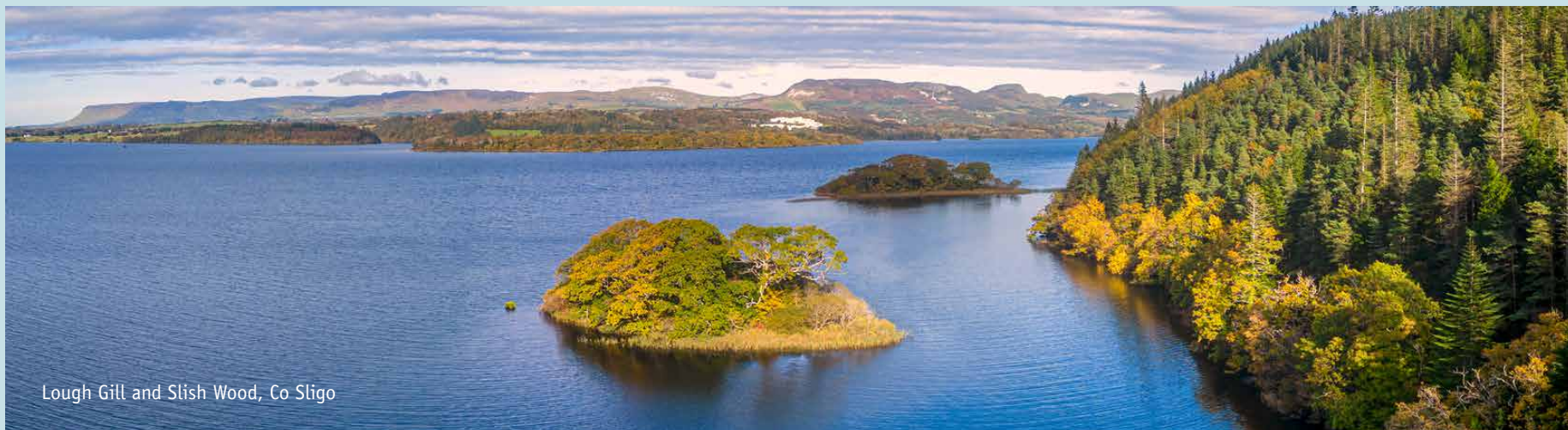
Lough Gill and Slish Wood, Co Sligo