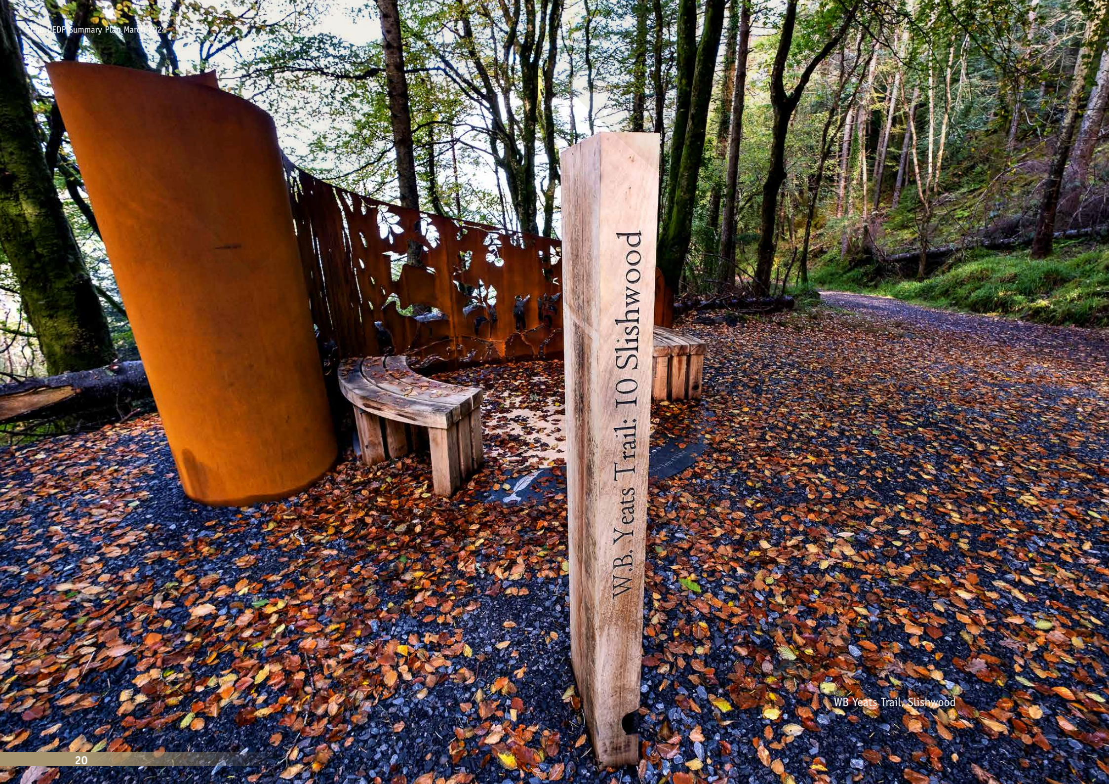
WB Yeats Trail, Slishwood