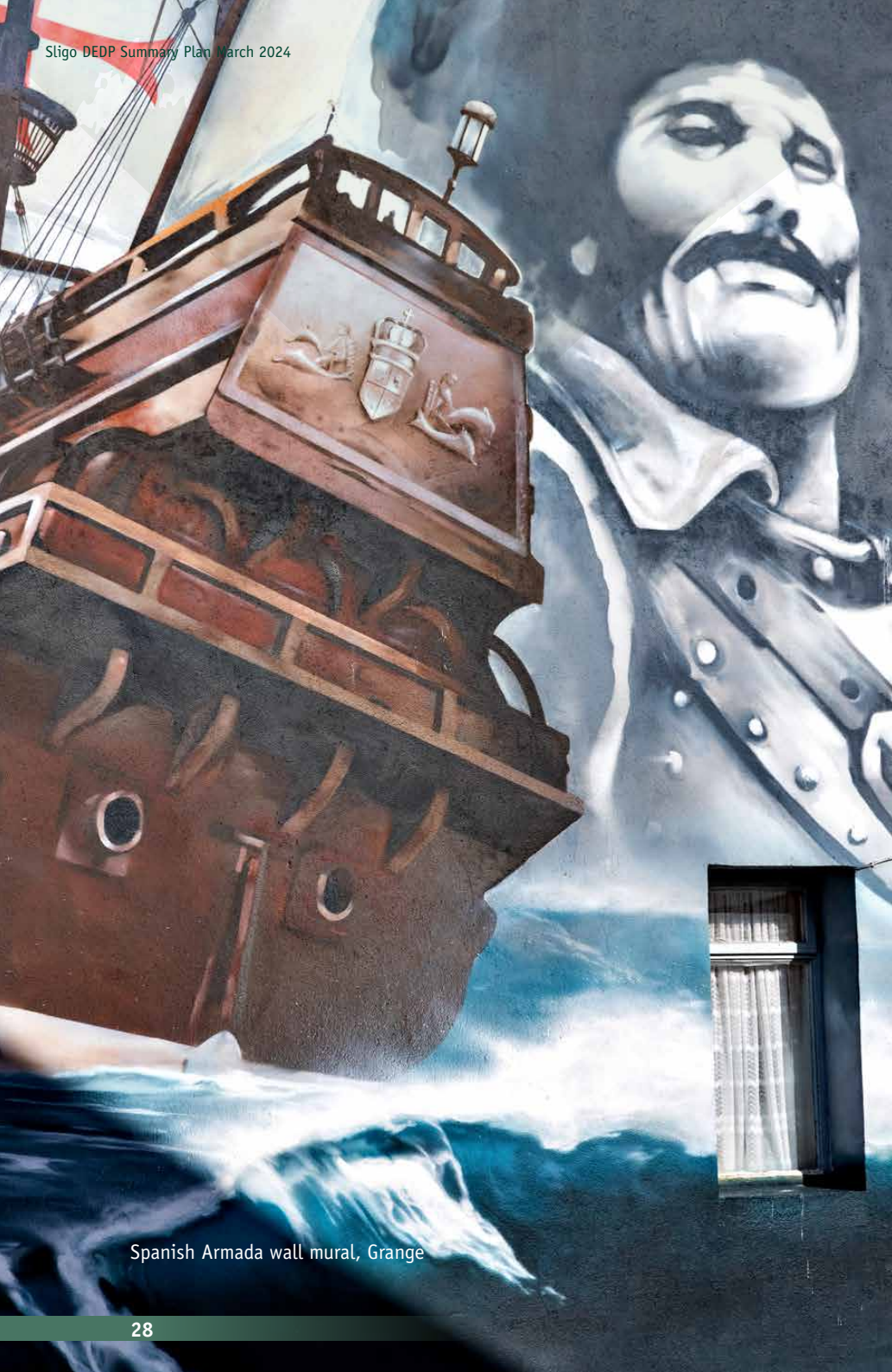
Spanish Armada wall mural, Grange