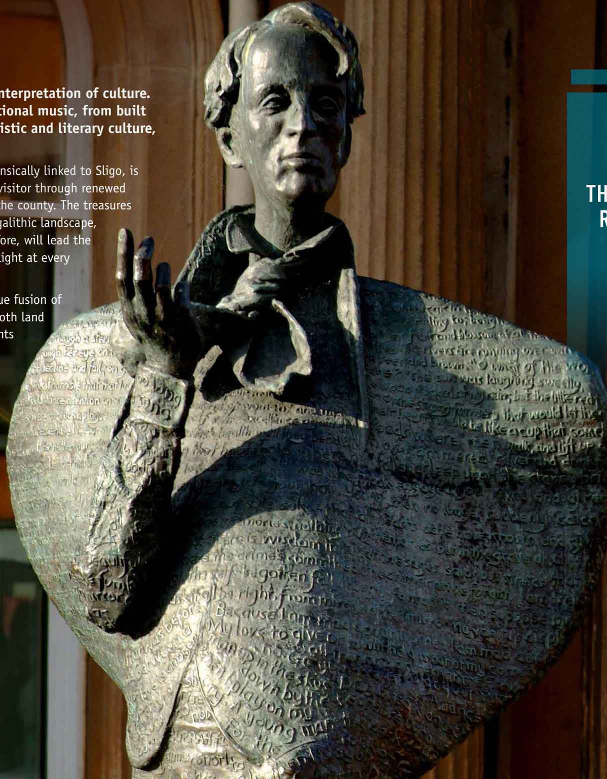
WB Yeats Statue