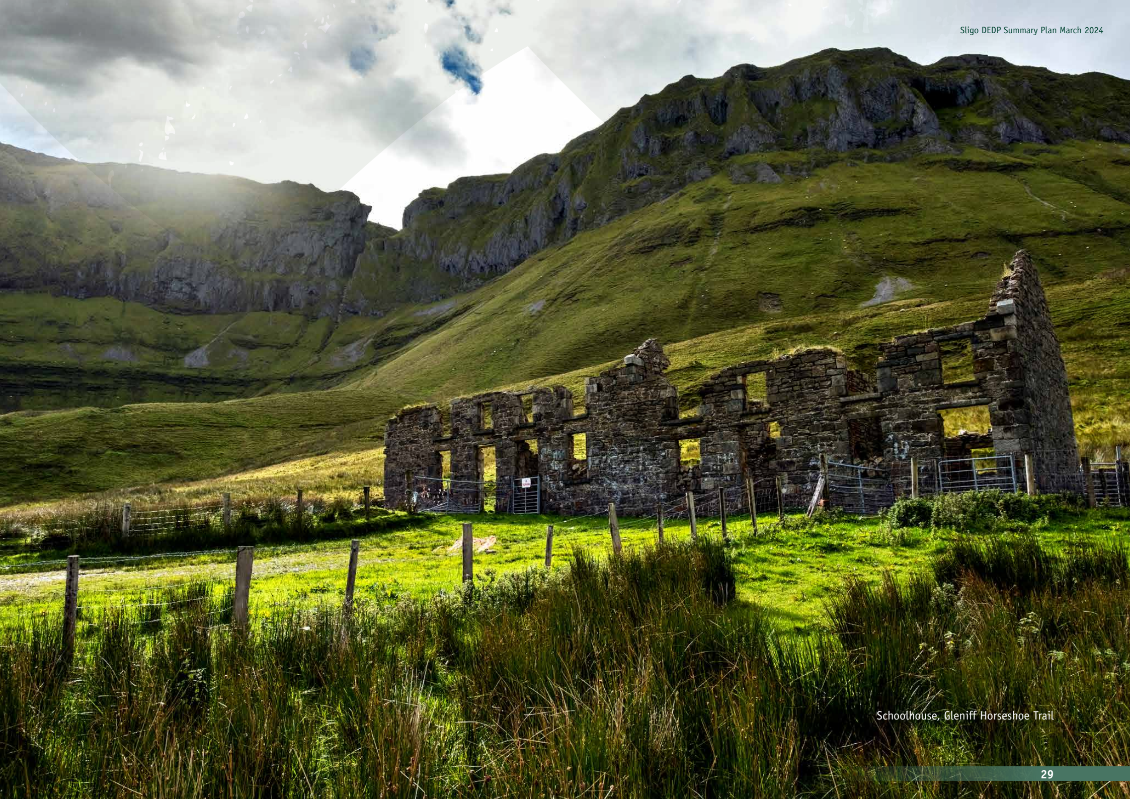
Schoolhouse, Gleniff Horseshoe Trail