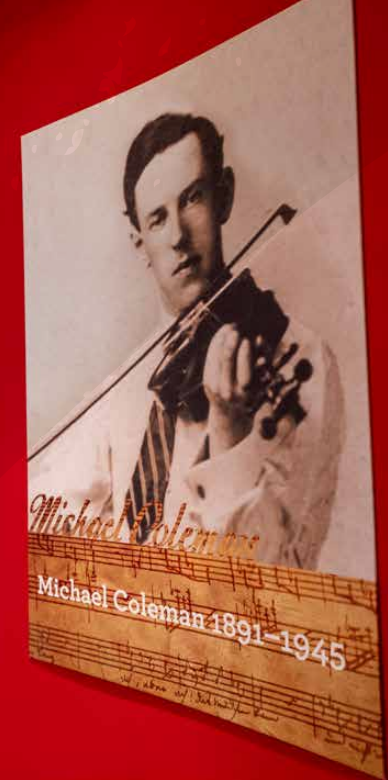
Coleman Centre Gurteen