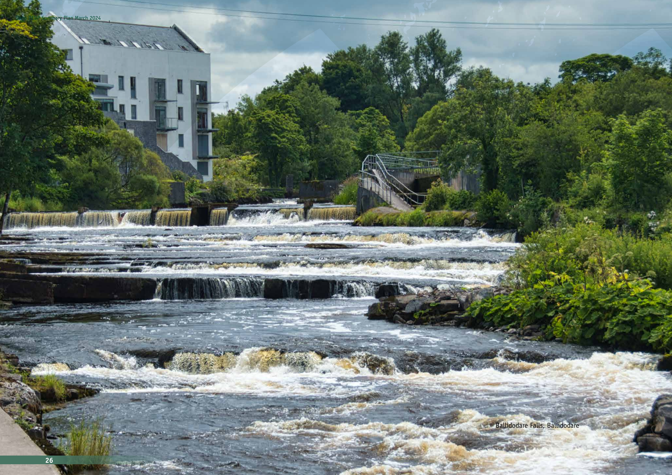
Ballidodare Falls, Ballidodare