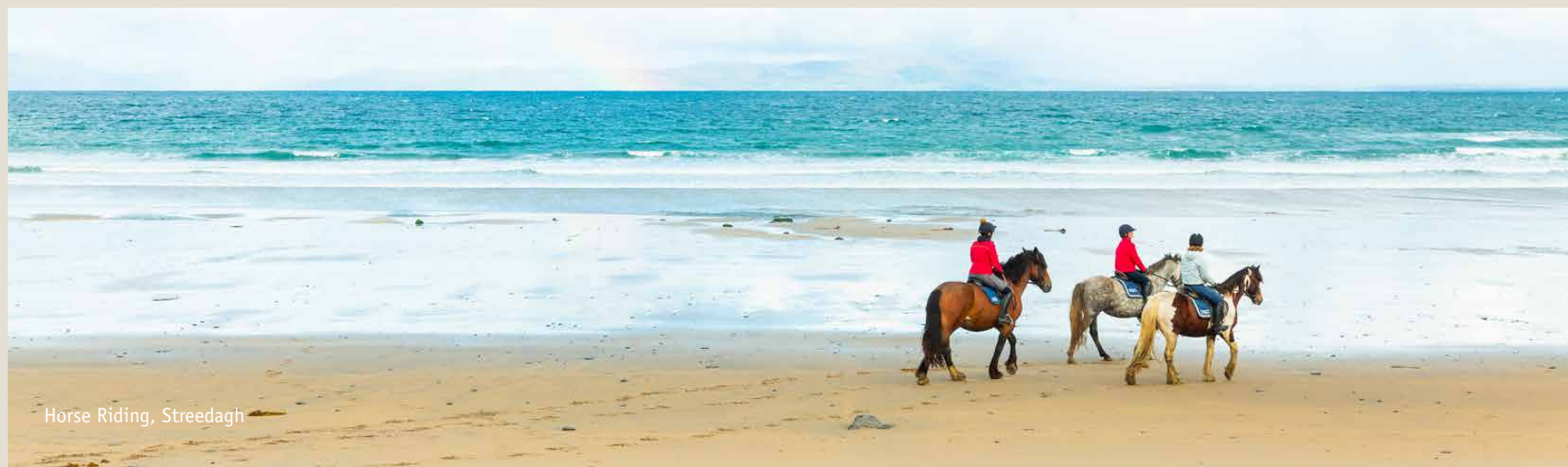
Horse Riding, Streedagh