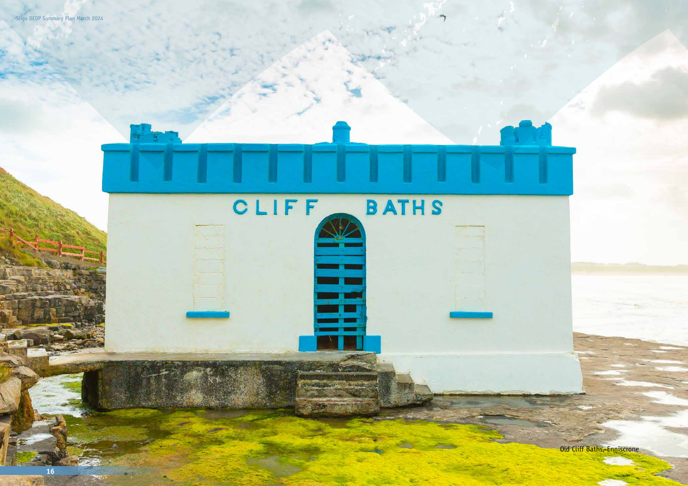
Old Cliff Baths, Enniscrone