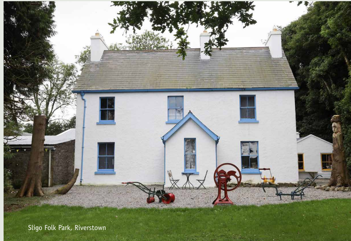
Sligo Folk Park, Riverstown

Sligo Town is the destination focal point possessing the majority of available bed stock in the county. It represents a town with significant tourism growth potential. The current urban regeneration investment provides the platform to rejuvenate the urban experience while proposed private sector investment in a new attraction at Hazelwood has the potential to be transformational in generating year-round visitor footfall to Sligo.