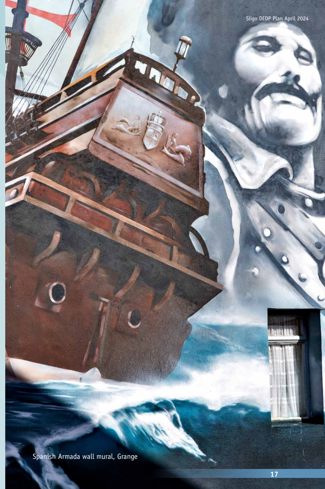
Spanish Armada wall mural, Grange