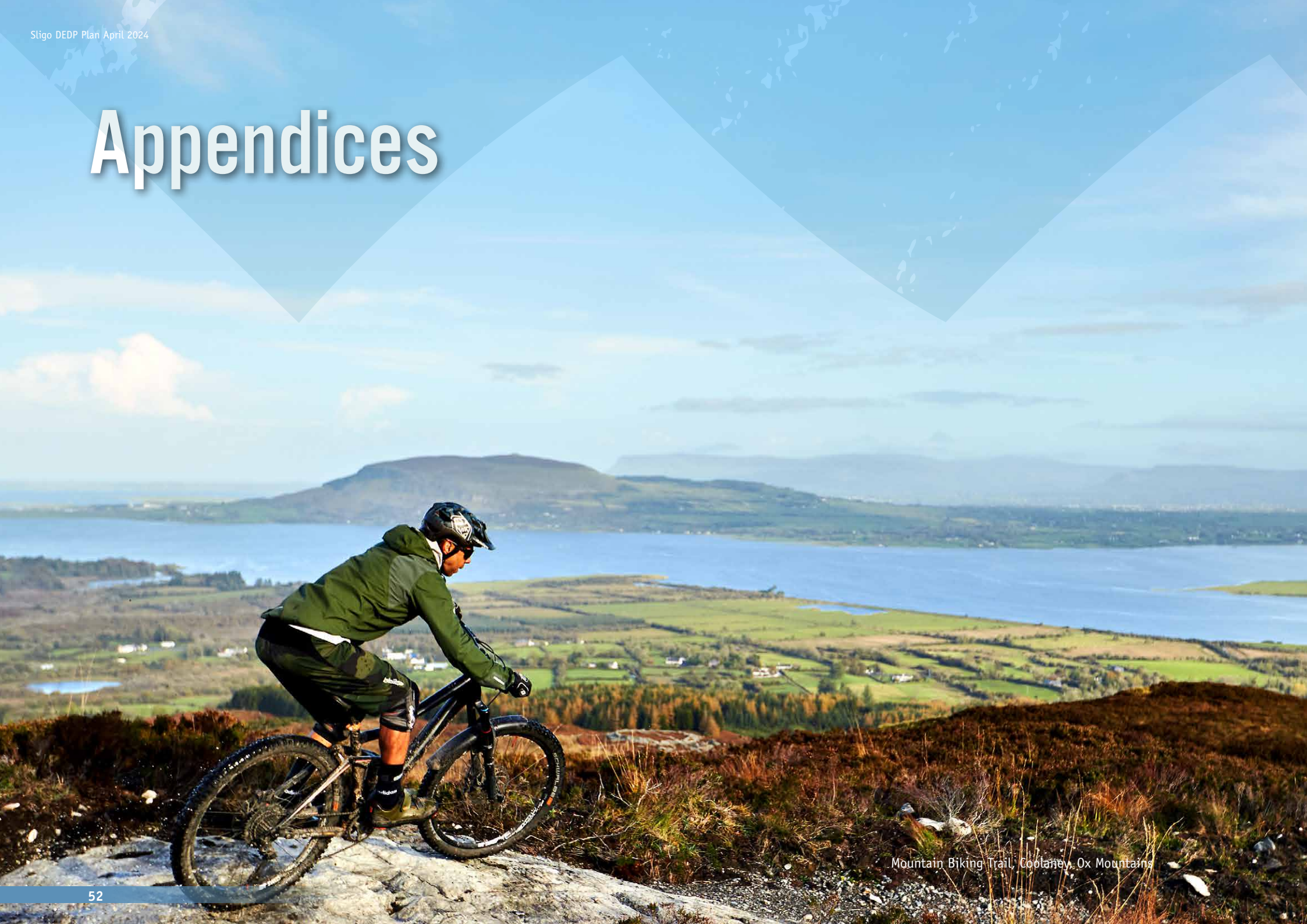
Mountain Biking Trail, Coolaney, Ox Mountains