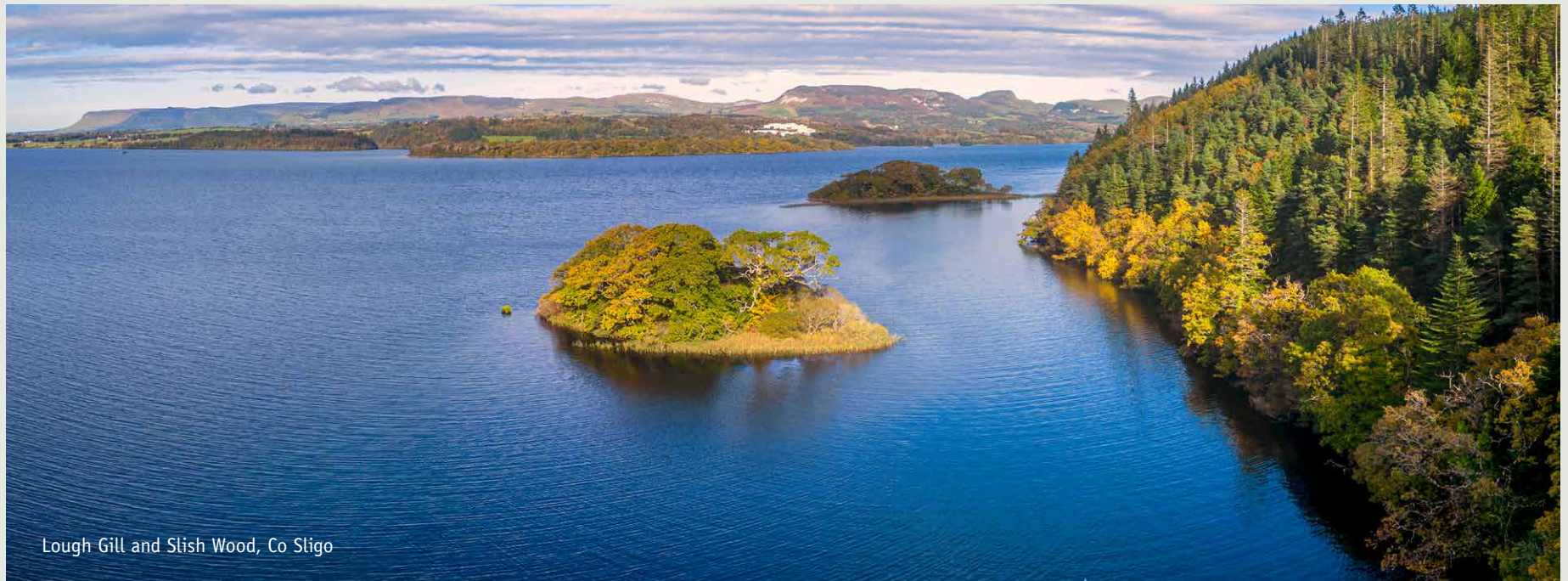
Lough Gill and Slish Wood, Co Sligo