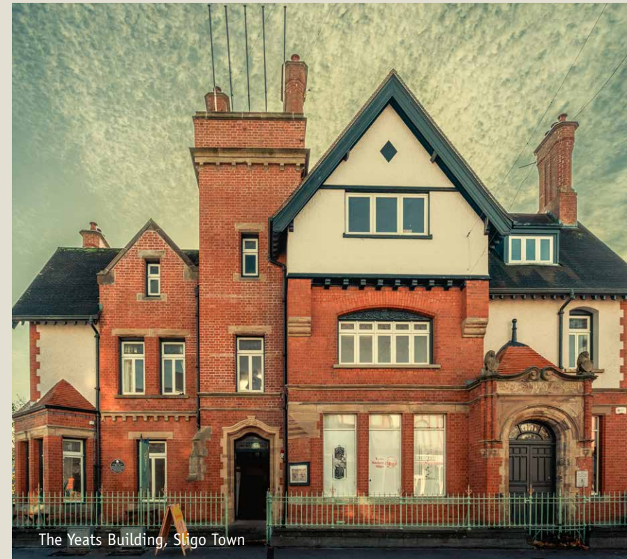
The Yeats Building, Sligo Town

The implementation of the Sligo DEDP is based on stakeholder commitment to project delivery and is structured around an action plan approach. Key stakeholders will take ownership or partner on the delivery of the key tasks required to implement the Sligo DEDP. It represents a five-year operational plan providing a commercial destination development focus building on existing project plans and integrating all related activity for a co-ordinated series of outputs. This includes projects that are being implemented, projects featured in existing plans and new concepts to build the destination's capacity for new visitor experience development.