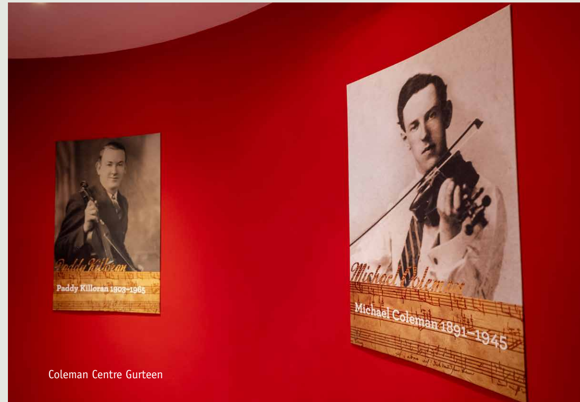
Coleman Centre Gurteen

There are many considerations in developing Sligo as a compelling visitor destination and how it can become the catalyst to transform tourism development in the Northwest. It requires strategic product investment aligned with a shared vision for developing an international class outdoors experience. Ensuring the appropriate levels of visitor infrastructure and services are in place across the county will be a key consideration. This coherent strategic approach will ensure all future infrastructure investment from public realm, signage and transport will be aligned with the ambition for tourism in Sligo. Ingrained within every aspect of the destination development will be distinctive Sligo visitor experiences delivered through our coastal and rural communities, our natural environment and a cultural scene that bounces to a unique Sligo rhythm.