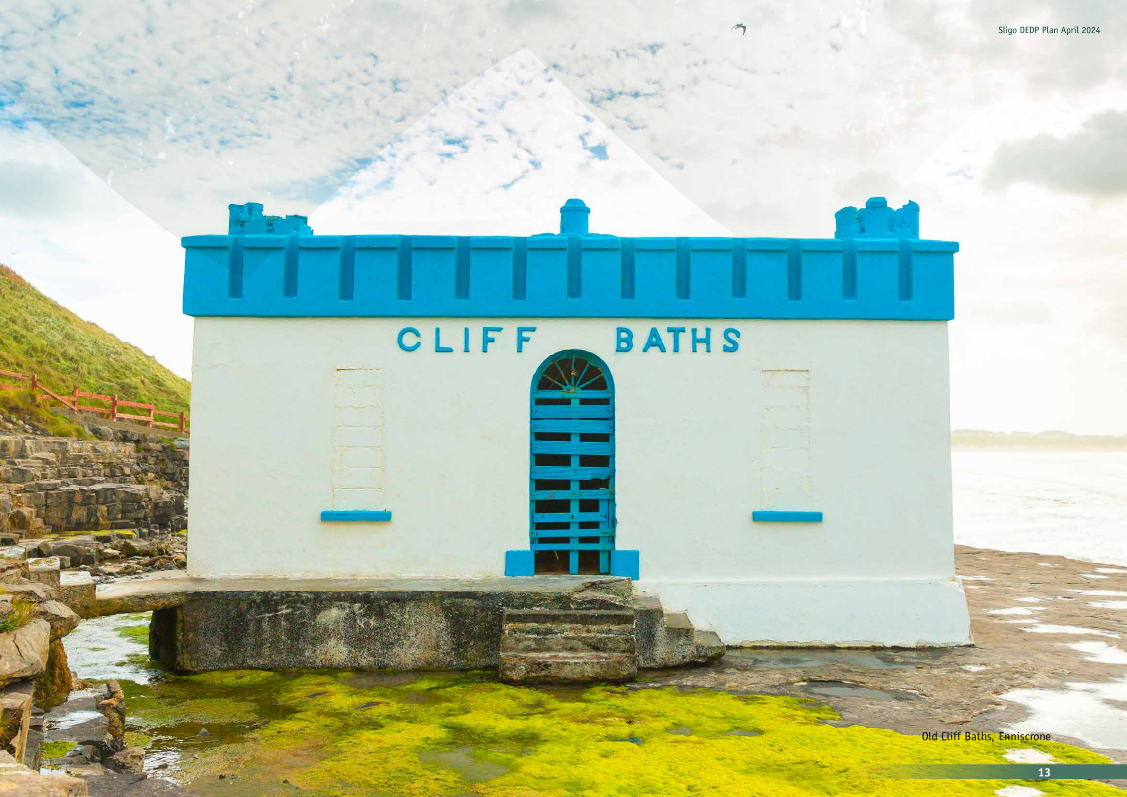
Old Cliff Baths, Enniscrone