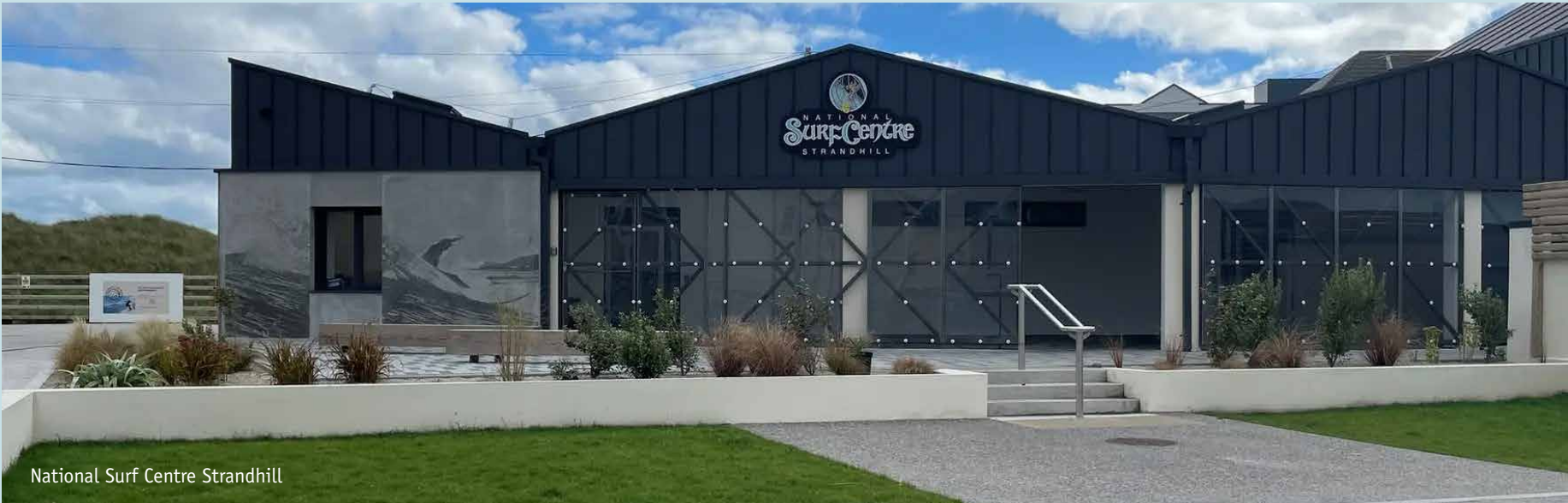
National Surf Centre Strandhill