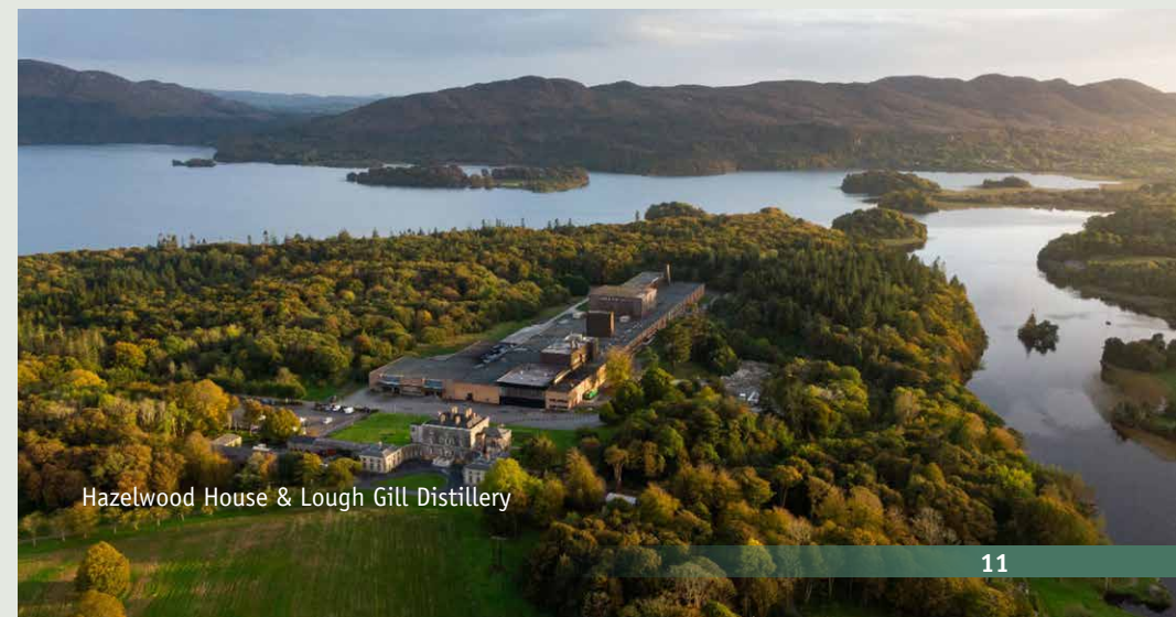
Hazelwood House & Lough Gill Distillery

There are elements of the story at sites and attractions such as Carrowmore, Grange, Lissadell House, the Yeats Building, and the new Yeats Trail. However, the story is disjointed with significant gaps while there currently are no iconic cultural experiences that act as a destination attractor for the county as a whole.