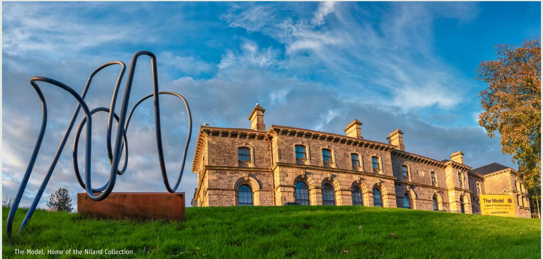
The Model, Home of the Niland Collection

A series of local reports and discussion papers on tourism related initiatives were also reviewed and have informed the actions in this plan.