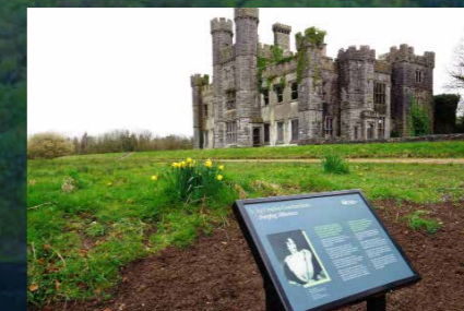
Castle Saunderson Demesne (Walk)